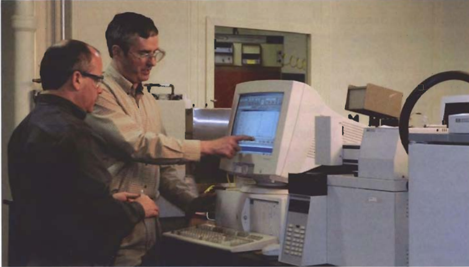
A composition analysis of Vu-Stat static dissipative acrylic multipolymer compound used for brachytherapy is performed to ensure that it will improve the efficiency of the procedure.