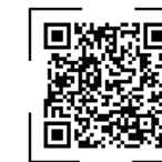
ACRYLITE® Neutral Grays

Images are intended for illustrative purposes only. Suggested material use by typical part performance criteria, subject to different OEM requirements.