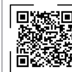
ACRYLITE® 8N & 8N plus